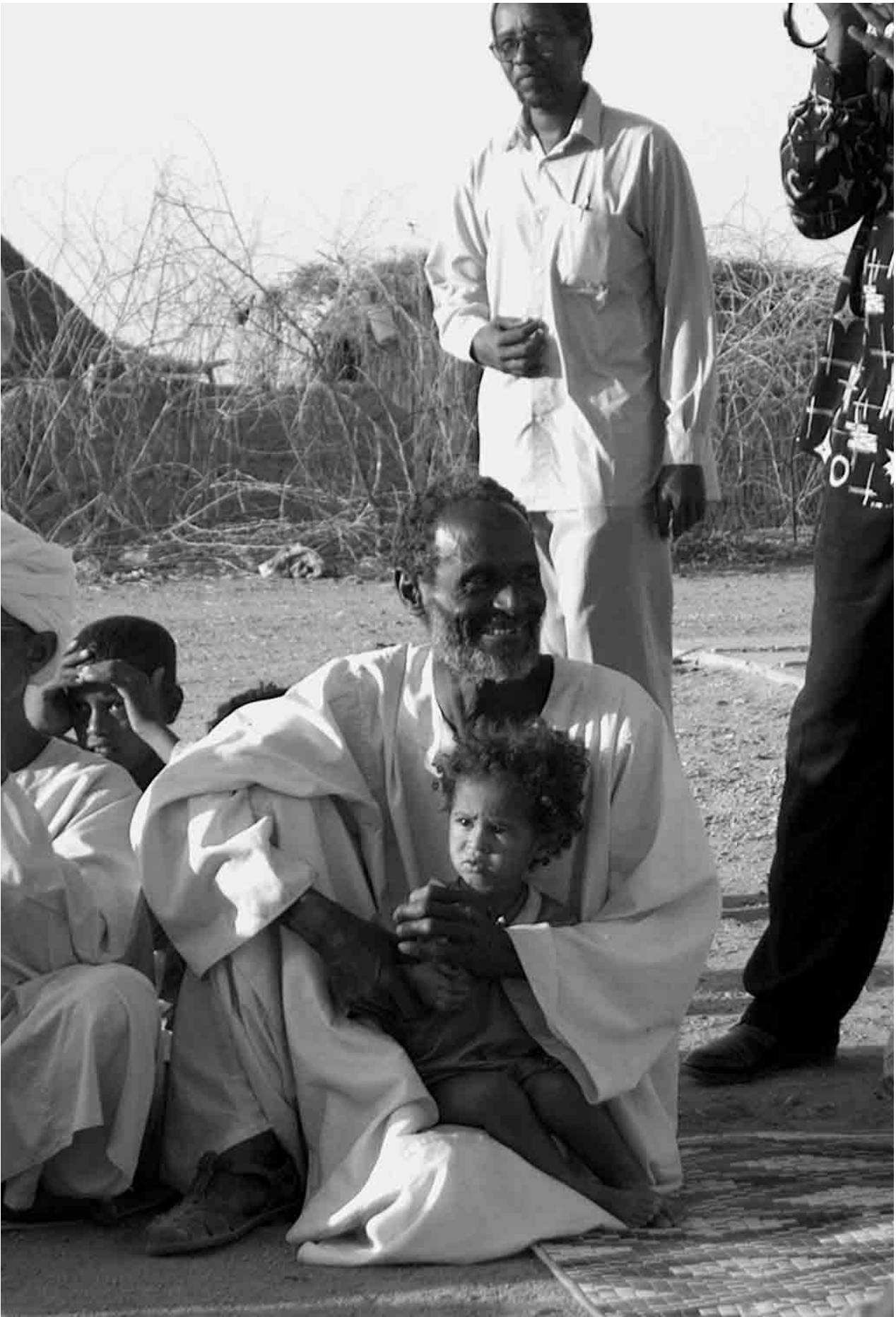
A man from the Beni amir ethnic group for eastern Sudan holds his daughter while attending a workshop on FGM, Idimair, Kassala State.